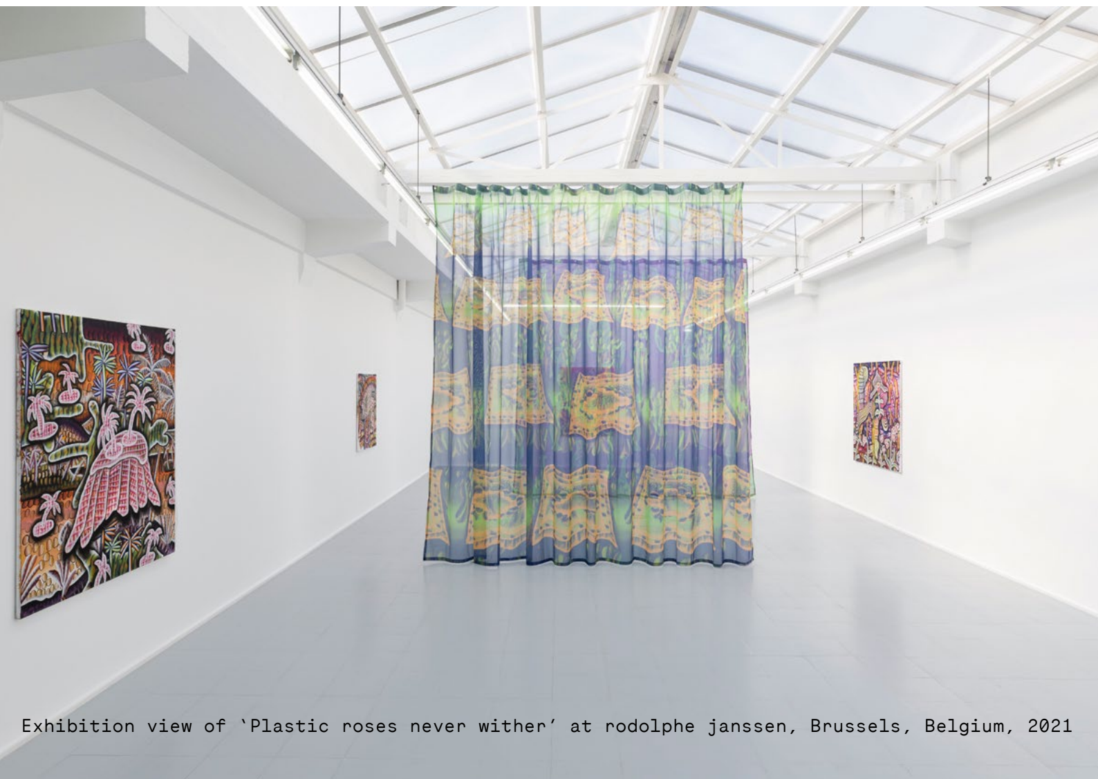
Exhibition view of 'Plastic roses never wither' at rodolphe janssen, Brussels, Belgium, 2021